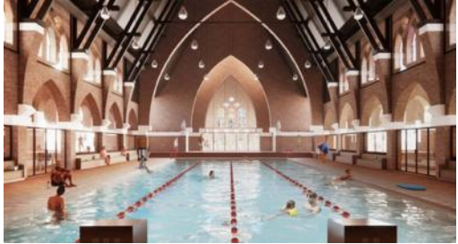
Pictured: The new swimming pool inside the church. Source: MVRDV / Zecc Architecten.

The St. Francis of Assisi Church was built more than 100 years ago, but it stopped holding services in 2023. So. builders and architects (people who design buildings) worked together and won a special competition to redesign the church. Their exciting swimming pool plan is called 'Holy Water'. A very clever part of the design is that the floor of the pool can move up and down, and the water can be added or taken away. This means the space can be used for lots of different activities too, not just swimming!