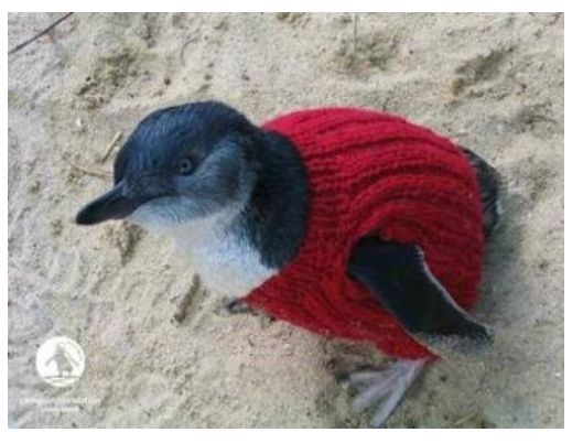
Pictured: A Penguin wearing a knitted jumper.

Knitters, from all over the world, have been sending mini woolly jumpers to a charity in Australia for over 20 years! The Penguin Foundation raises funds to protect and preserve Phillip Island, and its colony of 40,000 little penguins. When the wildlife rehabilitation centre launched the 'Knits for Nature' programme, it asked knitters to produce jumpers to help save penguins in the event of oil spills. Penguins were dressed in the jumpers, to prevent the poisonous oil covering their bodies from being ingested, until they could be cleaned by rescue workers. Rebecca Passlow, from The Penguin Foundation, explained that the jumpers fortunately haven't been needed to help penguins after an oil spill recently but are still very important to the charity. 'To